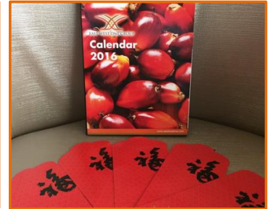
Distribution of calendar and red packets to investors and Planter's Consultants