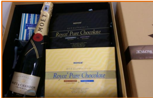
Distribution of premium hampers to our top investors in conjunction with the CNY celebration