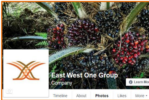
The launch of EWOG's official Facebook page