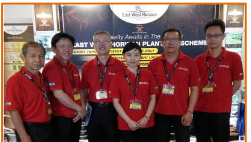
Roadshow at Spice Arena, Penang