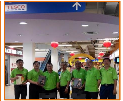
Roadshow at Tesco E-gate, Penang